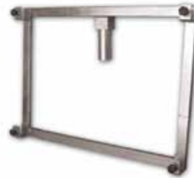
BT-072 TE-074 support for two lights bar. Insertion of 55 mm.