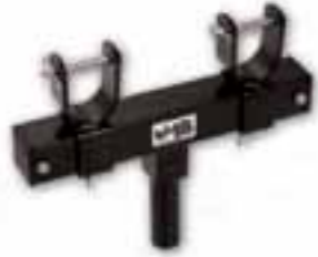
PSU-034B Truss support for TE-034 towerlift