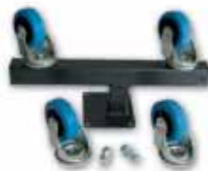
RH-3 Transport kit for TL-072.