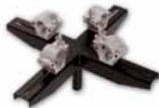
PSX-01 Adjustable 4 point alicraft support with insertion of 35 mm