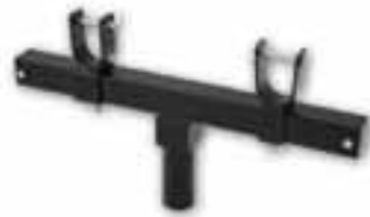
PSU-086B TE-086 adjustable support for truss, with U-piece and pin. Insertion of 50 mm