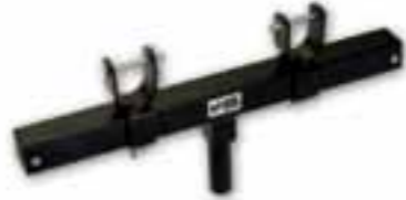
PSU-06B Adjustable support for truss, with U-piece and pin. Suitable for towerlifts with insertion of 35 mm. Also available in silver color, ref.: PSU-06