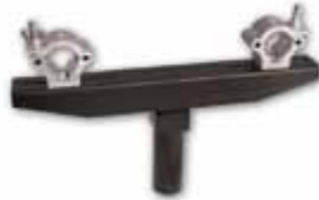
PSA-02 Adjustable support for truss, with tilting alicraft grips. For towerlifts with insertion of 55 mm.