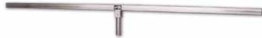
BT-07 TE-074 support bar with length of 1.89 m. Insertion of 55 mm.