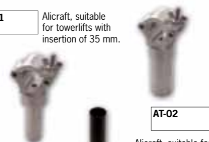
AT-01 Alicraft, suitable for towerlifts with insertion of 35 mm.