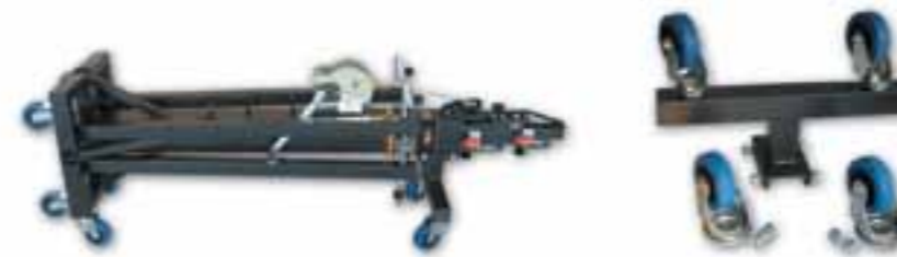
RH-1 Transport kit.