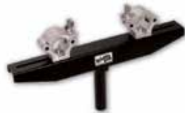
PSA-01 Adjustable support for truss, with tilting alicraft grips. For towerlifts with insertion of 35 mm.