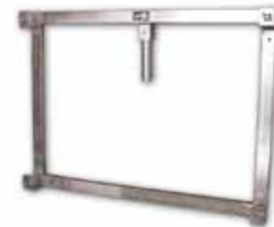
BT-062 Support for two lights bars. Suitable for all towerlifts with insertion of 35 mm.