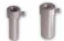
TE-074 adaptor for Spigot with insertion of 29 mm. Towerlift insertion of 55 mm.