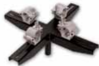
PSX-02 Adjustable 4 point alicraft support with insertion of 55 mm