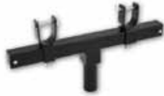
PSU-074B TE-074 adjustable support for truss, with U-piece and pin. Insertion of 55 mm. Also available in silver color, ref.: PSU-074