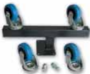
RH-2 Transport kit for TL-054, TL-056 & TL-A220