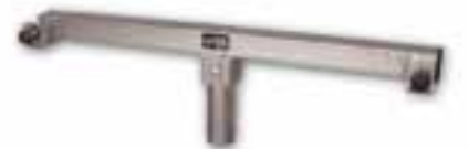
BT-062 TE-074 support for lights bar. Insertion of 55 mm.