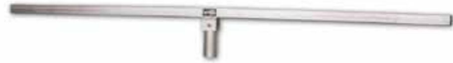
BT-07 TE-074 support bar with length of 1.89 m. Insertion of 55 mm.