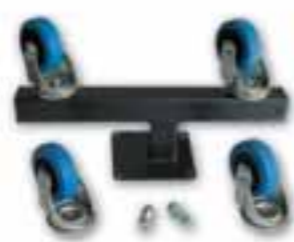
RH-4 Transport kit for TL-075, TL-078 & TL-A320